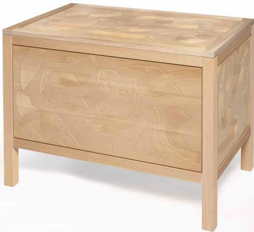
Blanket Chest with Birds