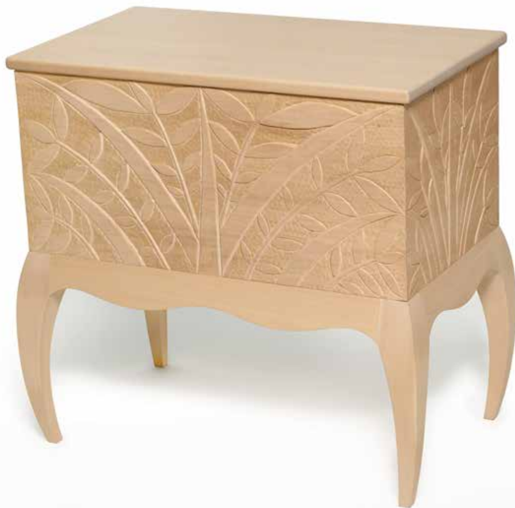
Blanket Chest with Foliage