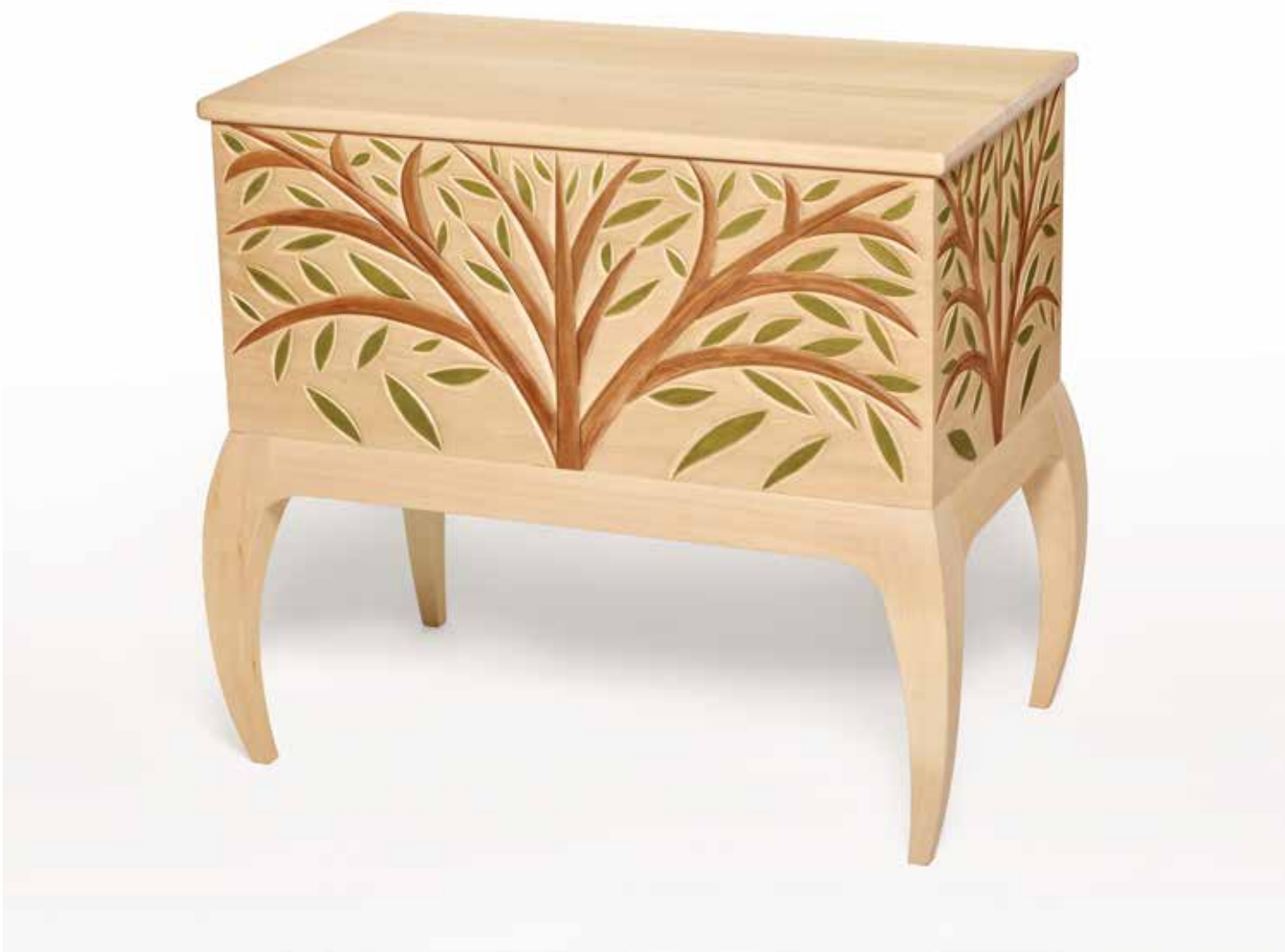
Painted Blanket Chest with Leaves