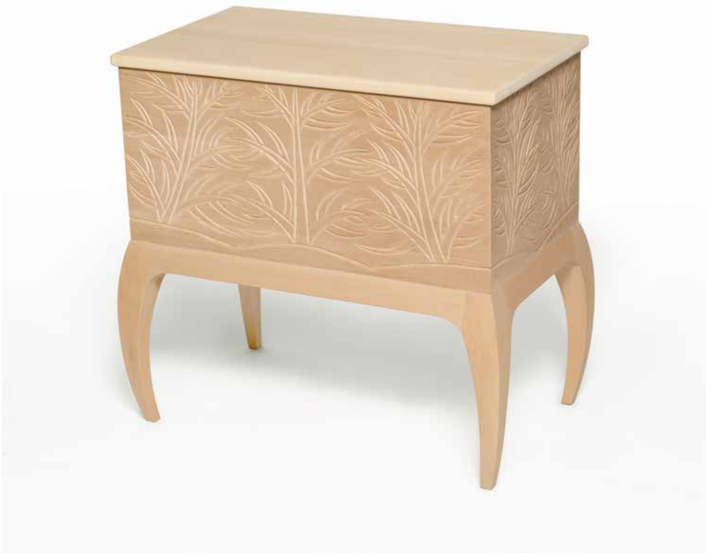
Blanket Chest with Trees